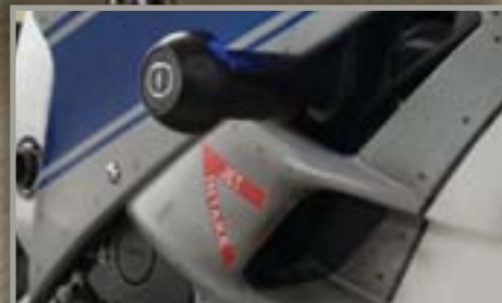
Puig frame-sliders come in handy whenever the pilot has to hit the eject button.