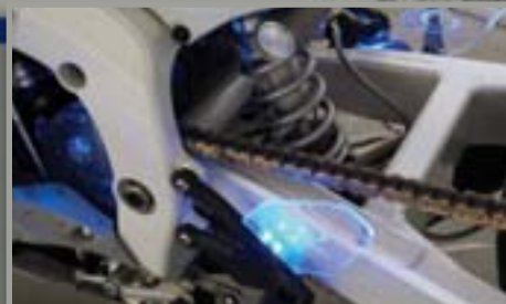
Super clean details abound, like the matched LED heel guards and the powdercoated swingarm.