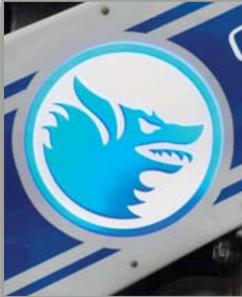
The Wolfpack logo represents one of the most famous fighter squadrons in the US Navy, being the first to fly the F-14 of Top Gun fame.

With such a monumental joint venture, it only made sense for Gator Customs to build a bike to promote the new Wolfpack helmet as a way of kicking things off. The Wolfpack R6 is painted to match the helmet, with Gator Glass™ aplenty. The Wolfpack logos on the windscreen, side panels and tail all illuminate, as do the "ejection" stencils on each side.