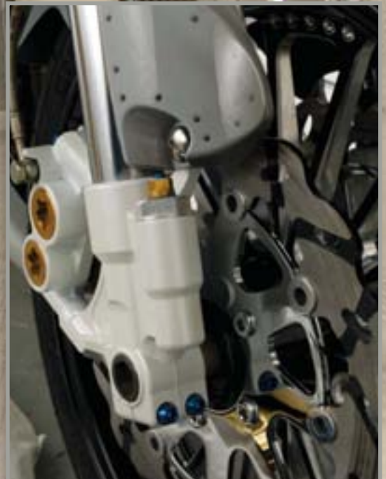
Providing the arrester-hook-like braking is a set of the latest Superbike Wave rotors from Galfer on chrome carriers.

In addition to the swingarm, a lot of parts had to be modified to fit the middleweight machine. The front wheel wouldn't even fit without a new set of spacers and hubs, but Kleber enjoys building a bike that involves more than simply bolting on parts.