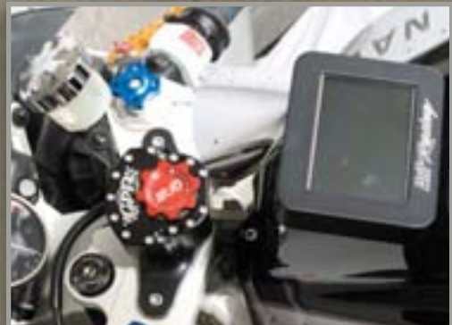
Race-quality GPR damper and AnT Racing rear camera system provide extra control and vision for the pilot.