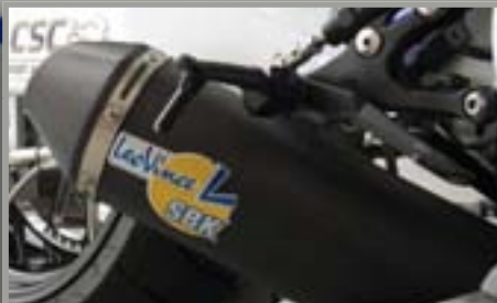
LeoVince SBK exhaust system provides the roar of a fighter jet and the power to match.