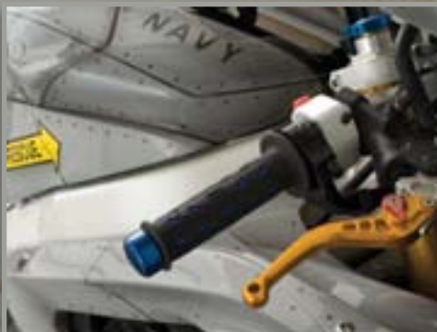
Trick CRG levers allow plenty of adjustment to tailor the riders cockpit to their personal tastes.